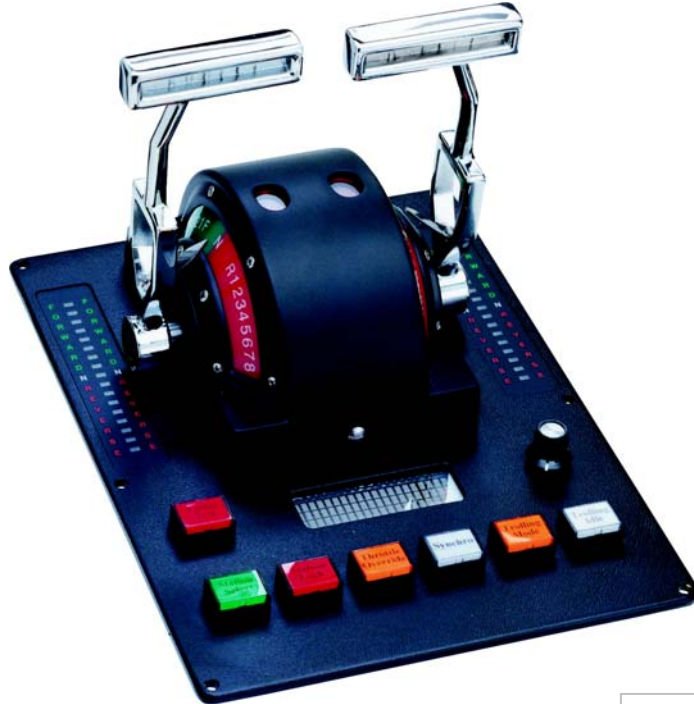
Shown with Model 6555 Control Head